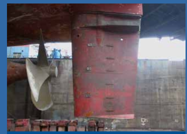
The old rudder on a vehicles carrier

When it comes to manoeuvrability, reliability, efficiency and cavitation avoidance, Becker combines experience with new technologies such as CFD to develop the optimal solution for operators. We are the top choice to provide the perfect rudder replacement. Together with the customer, the Becker Service Team will analyse the individual requirements. Becker's design and CFD team is skilled in providing the best solution to simplify installation and fulfil the customer's expectations in terms of manoeuvrability and efficiency.