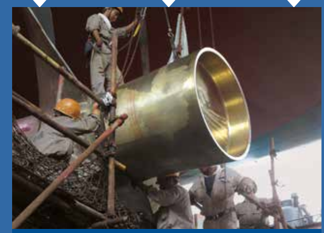
Installation of an optimised hub cap designed by Becker